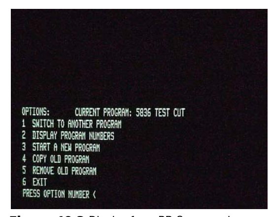
Figure 10-3 Display from PR Command

From "ENTER NEXT COMMAND" type PR then press ENTER the following menu will appear: